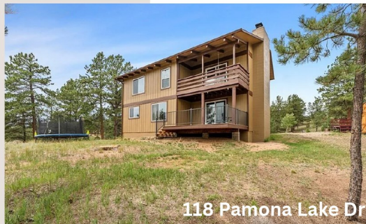
118 Pamona Lake Dr