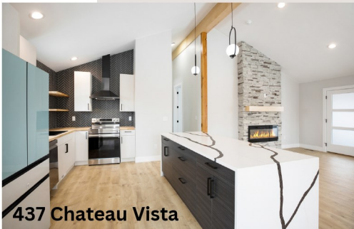
437 Chateau Vista