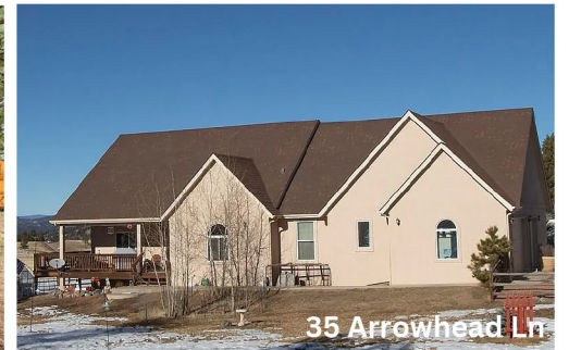
35 Arrowhead Ln